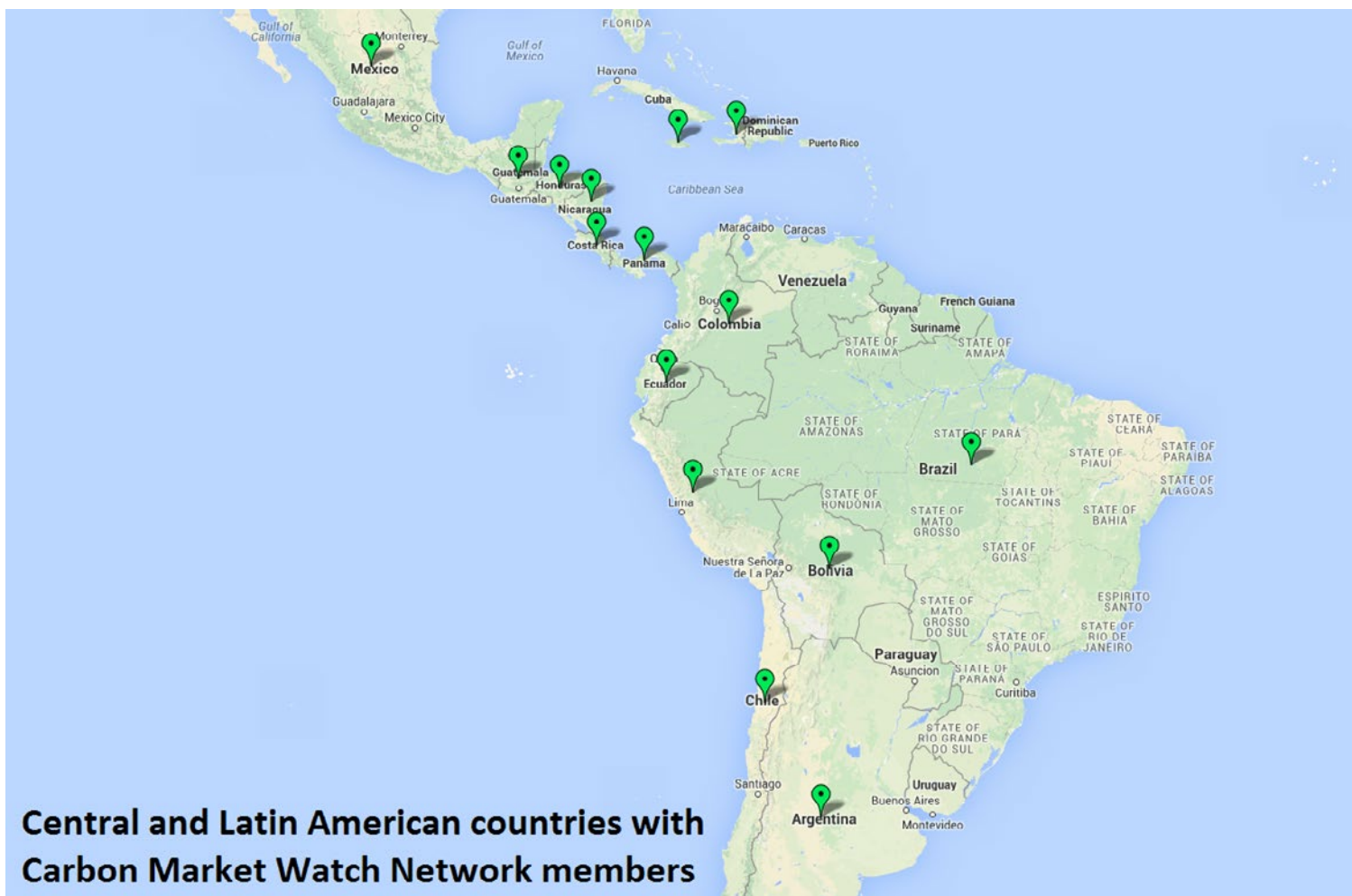
Central and Latin American countries with Carbon Market Watch Network members

The story behind Santa Rita drew together several civil society organisations, content to alarm about the hefty misconduct around the project.