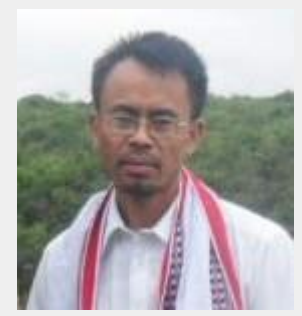
By Jiten Yumnam, Centre for Research and Advocacy, Manipur

In the state of Sikkim, land of rhododendrons, in the Himalayan foothills in India's North East, rivers have been aggressively dammed over the last decades. Dam developers are pushing these projects as clean energy sources to seek carbon credits as additional profits from the UN Clean Development Mechanism (CDM). More than fifteen mega hydro projects are already seeking carbon credits in Sikkim where hydropower is common practice. Some of these wrong decisions should be reversed and no further projects must be approved.