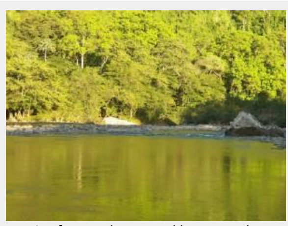
Native forests threatened by Barro Blanco hydrodam.