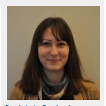
By Adela Putinelu, Carbon Market Watch

emissions; individual companies receive pollution permits that they can trade to lower their costs of compliance with assigned climate targets. In theory, the declining emissions' cap will create market scarcity and hence incentivize the emitters to cut down pollution and invest in cleaner technologies.