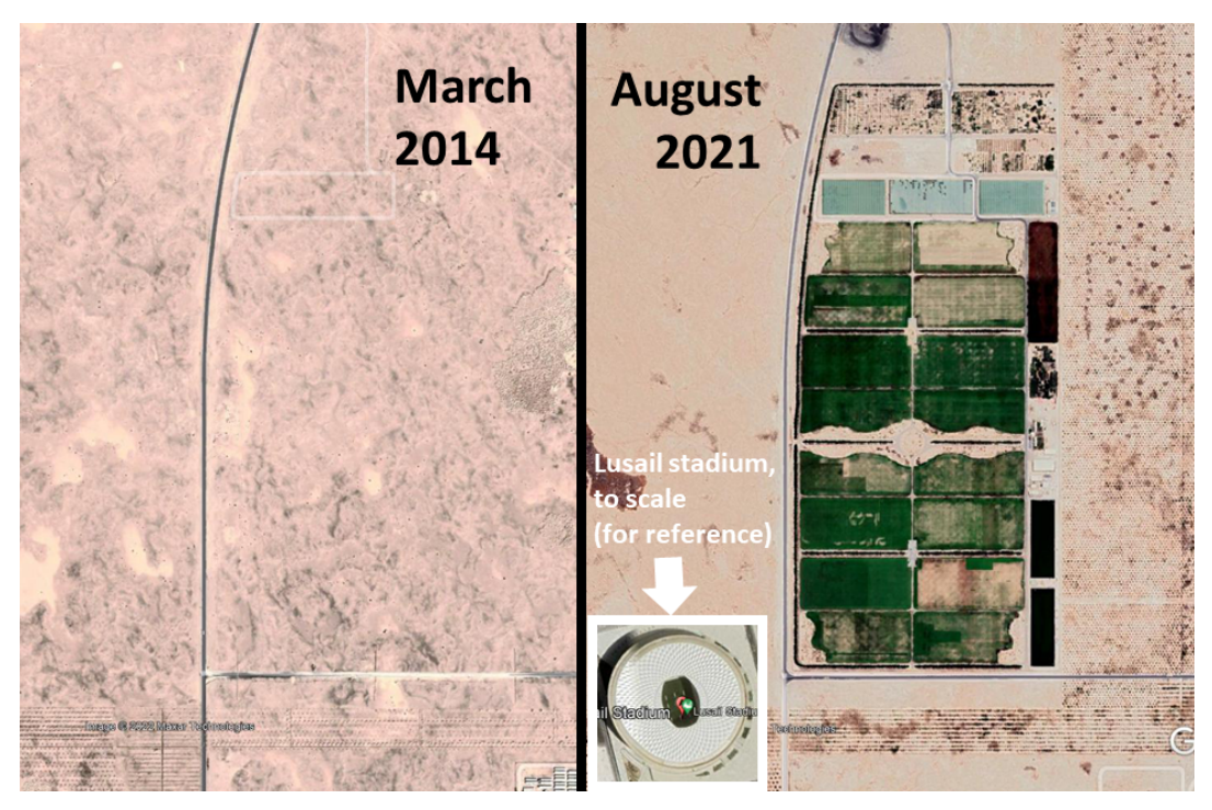
Lusail stadium is the largest of the FWC stadiums, with a capacity of 80,000 seats. It is represented here to show the scale of the turf farm. Lusail stadium is not located next to the turf farm.

The tree and turf nursery is located next to a large sewage treatment facility and the treated water will be used to irrigate the plants. However, it is unclear whether this might displace the use of water that is otherwise needed to meet the demand from a population and its economic activity in this arid region.