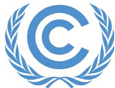
United Nations Framework Convention on Climate Change

The different legal frameworks of the Kyoto Protocol and the Paris Agreement lead to a number of challenges in implementing the SDM. The Kyoto Protocol's commitment periods will end in 2020. Parties now need to actively decide how to transition the protocol's instruments and its institutions, including the CDM in the Paris framework.