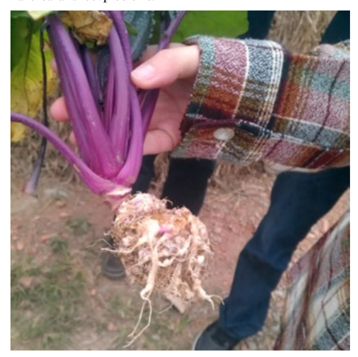
Leaf vegetable with root problems, which are seen much more than before the incinerator

Fruit trees now have less produce with inferior quality; veggies have leaf and root problems.