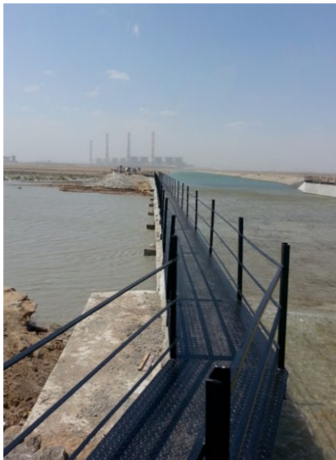
Kotdi CREEK Bloked by Adani Power Intek Chanel and Road

health of the local population, as it contaminates fish and makes it unsafe to consume. Local communities are influenced the most as mangroves have been destructed and fishing routes blocked due to the constructions needed for the coal power plant.