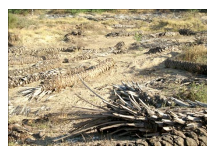
Damaged of Indian Date(Kachchhi Kharek) by Adani Power

Local communities have also reported monthly lethal incidents in the company. Force has been reported to close down a creek that endangers the livelihoods of several fishermen. Also livelihood of farmers has been endangered as the grazing land of 14 villages was taken away. The project does neither support sustainable development, nor promotes environmental integrity. The Adani Mundra project is clearly in violation with the mandate of the Clean Development Mechanism.