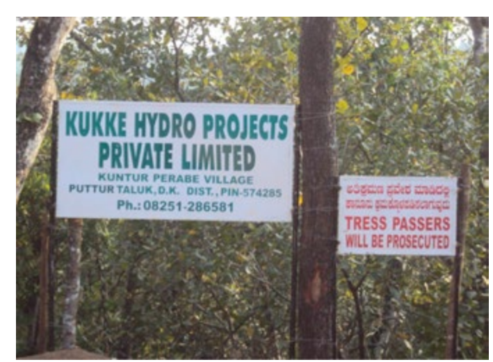
Board of the Kukke Project with background dense forests that will be destroyed for the project

SANDRP is an informal network of organisations working towards protecting rivers, ecosystems and communities in India and South Asia (http://sandrp.in/, http://sandrp.wordpress.com/)