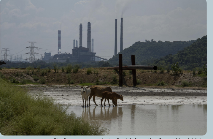
The Sasan power project

But this is only the beginning. More than 40 other coal projects are trying to get registered. These coal plants are expected to emit well over 4 billion tonnes of CO2 by 2020. In addition, if registered, these coal power projects could generate more than 500 million CDM offset credits from now until 2020.